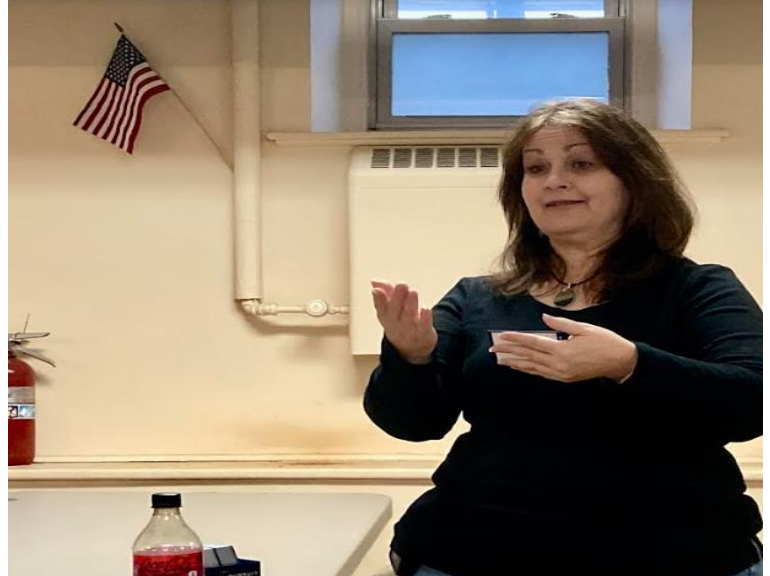
March 15 th Trivia Night Festivities!